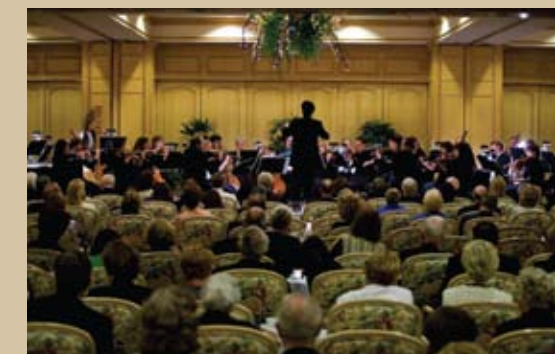
Rancho Sante Fe's Del Mar Country Club