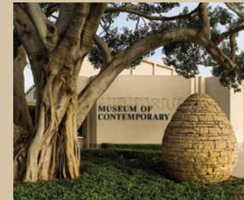
La Jolla's Sherwood Auditorium